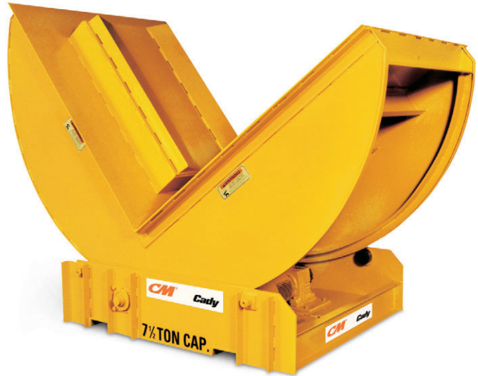
SHOWN WITH V-BLOCK OPTION

NOTE: If load is not a coil, specify center of gravity of load being rotated.