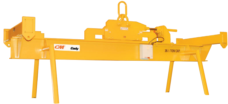
SPECIAL 4-POINT MOTORIZED BEAM WITH LOAD GUIDES.