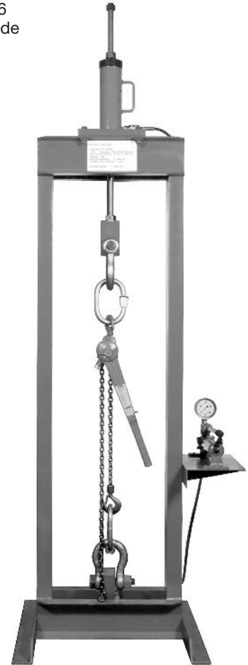
12 Ton Test Stand Product Code 1200